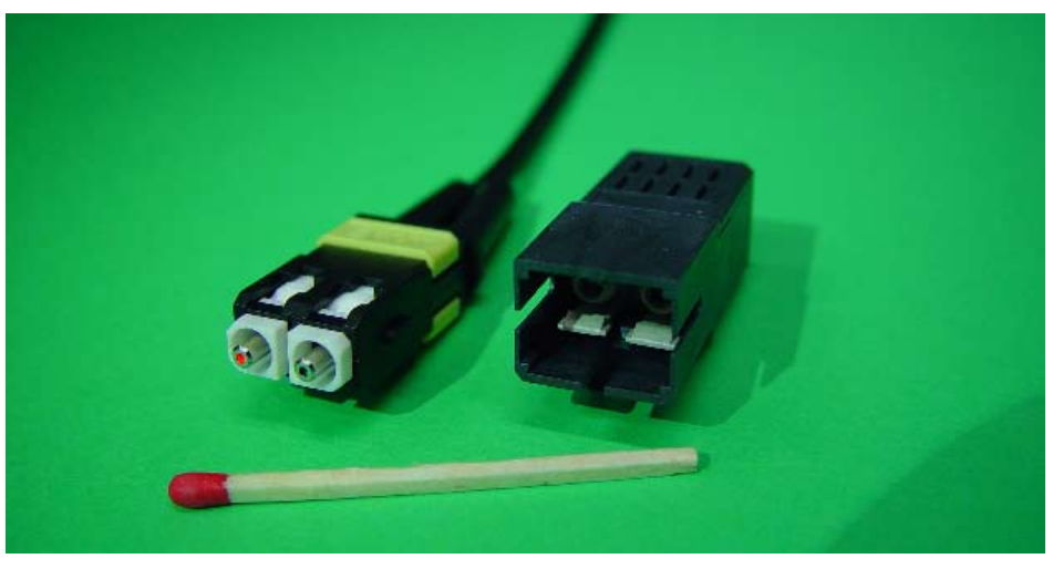
Fig.1 Gbit/s-Transceiver for duplex POF in SC-RJ-Package

Data transmission with POF (polymer optical fibers)